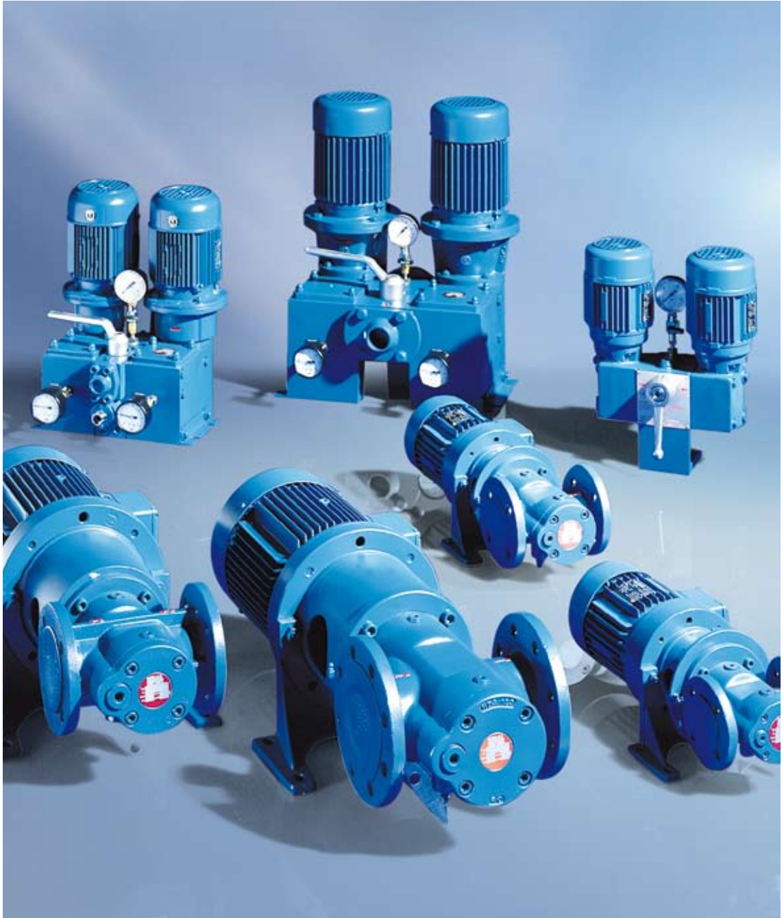
Selection from series K and DL/DS.